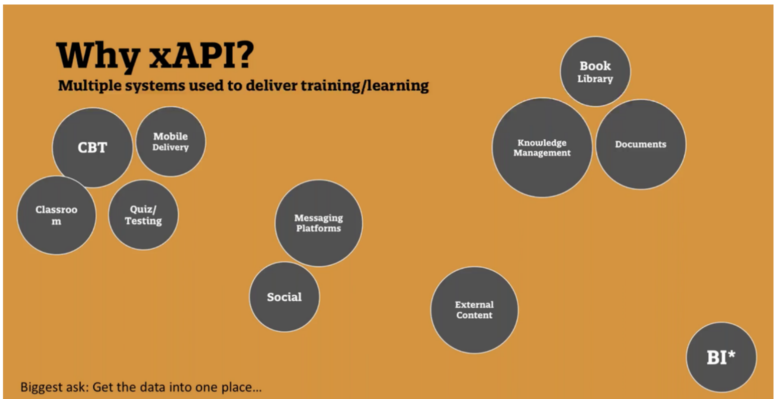
Image 1: Before integrating xAPI, Quicken's learning ecosystem consisted of disparate systems that couldn't communicate with each other.

While these emerging technologies provide the flexibility to use multiple systems to deliver training and learning content, the analytics from these different systems need to be available in a central location and provide reporting in the same language (see Image 1).